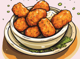
Falafel with a vegan mayo dip