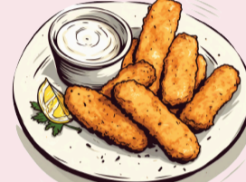
Mini fish goujons & tartare sauce