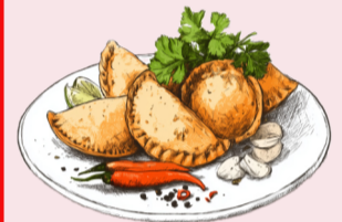
Mini pie selection